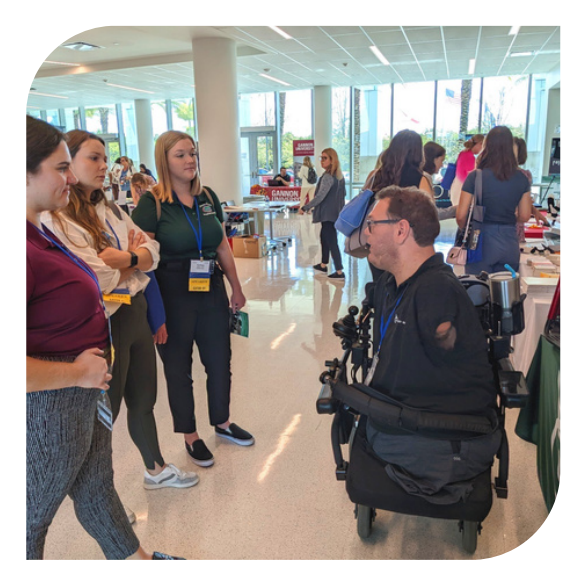
Save The Date: Nov. 4-5, 2023

The Florida Occupational Therapy Association (FOTA) is the state's professional association of Occupational Therapists, Occupational Therapy Assistants, students of Occupational Therapy and retired Occupational Therapy and retired Occupational Therapists. The primary mission of FOTA is to serve as a collective body to support, develop, and represent the Occupational Therapy profession for the advancement of the practice and to better serve the consumer.